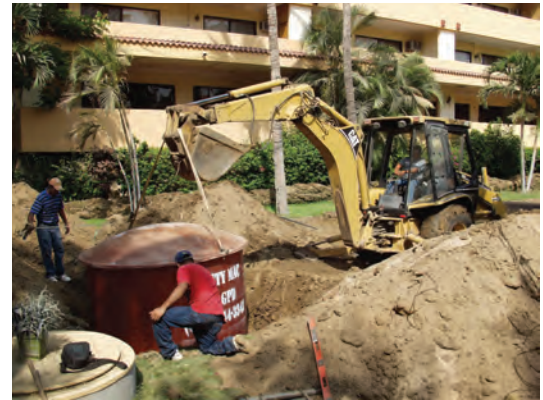
Setting the first of eight Mighty Macs