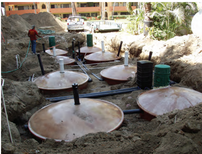
Mighty Mac 3,000 GPD System

All Mighty Mac Waste Treatment Plants are NSF International certified systems against defects in material and workmanship for two years from date of installation. In addition, each system comes with a two year service and maintenance contract which can be extended.